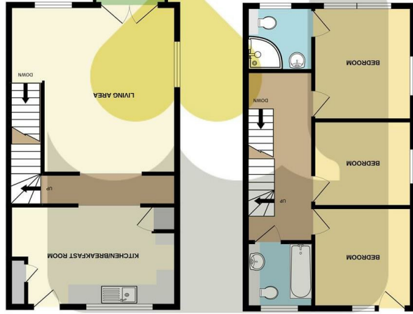
FIRST FLOOR 475 sq ft (44.1 sq m) approx.